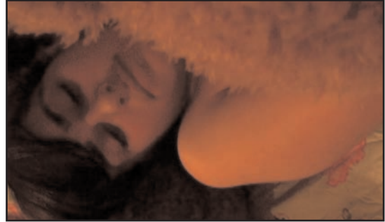
We Fuck Alone

Director: Gaspar Noé Duration: 23 minutes