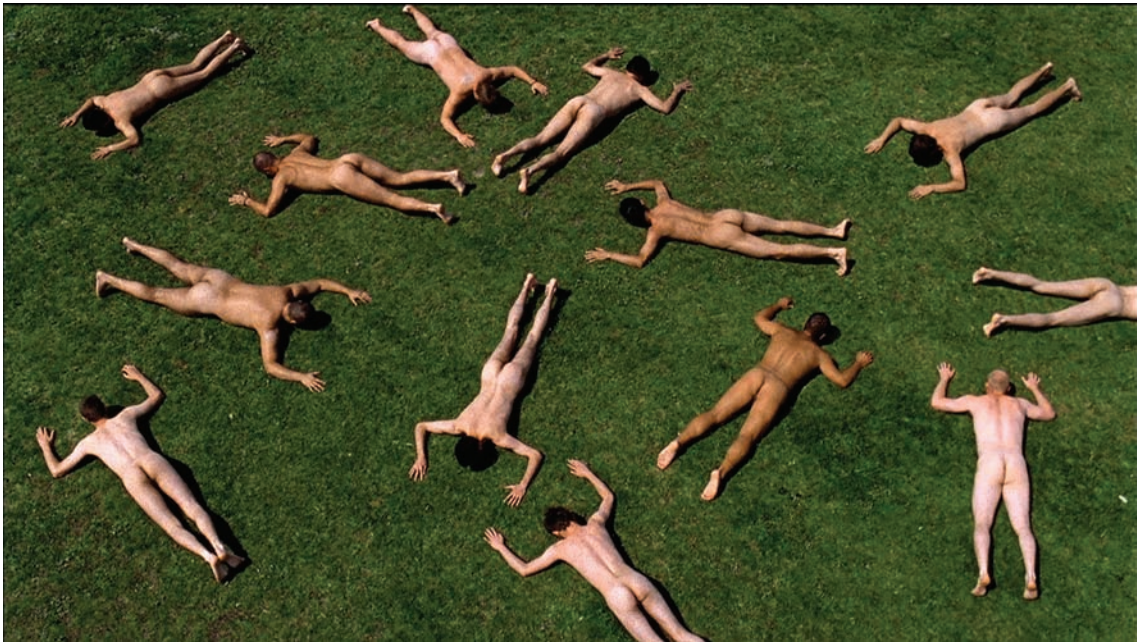
Balkan Erotic Epic, © 2005, Marina Abramovic

Marina Abramovic Matthew Barney Marco Brambilla Larry Clark Gaspar Noé Richard Prince Sam Taylor-Wood