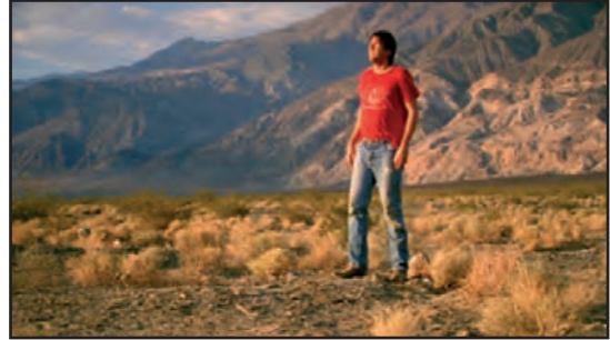
Death Valley, © 2004, Sam Taylor Wood