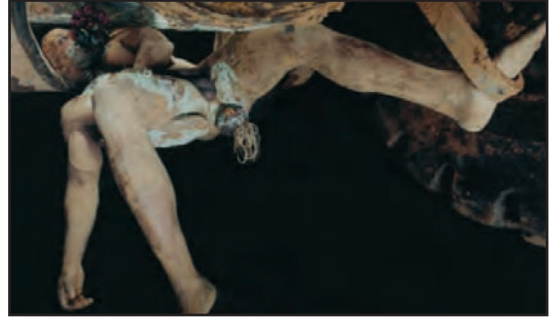
HOIST © 2004 Matthew Barney